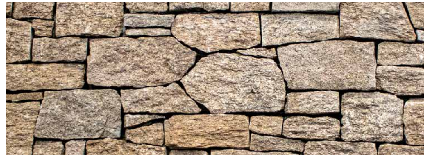
RUSTIC GRANITE Granite