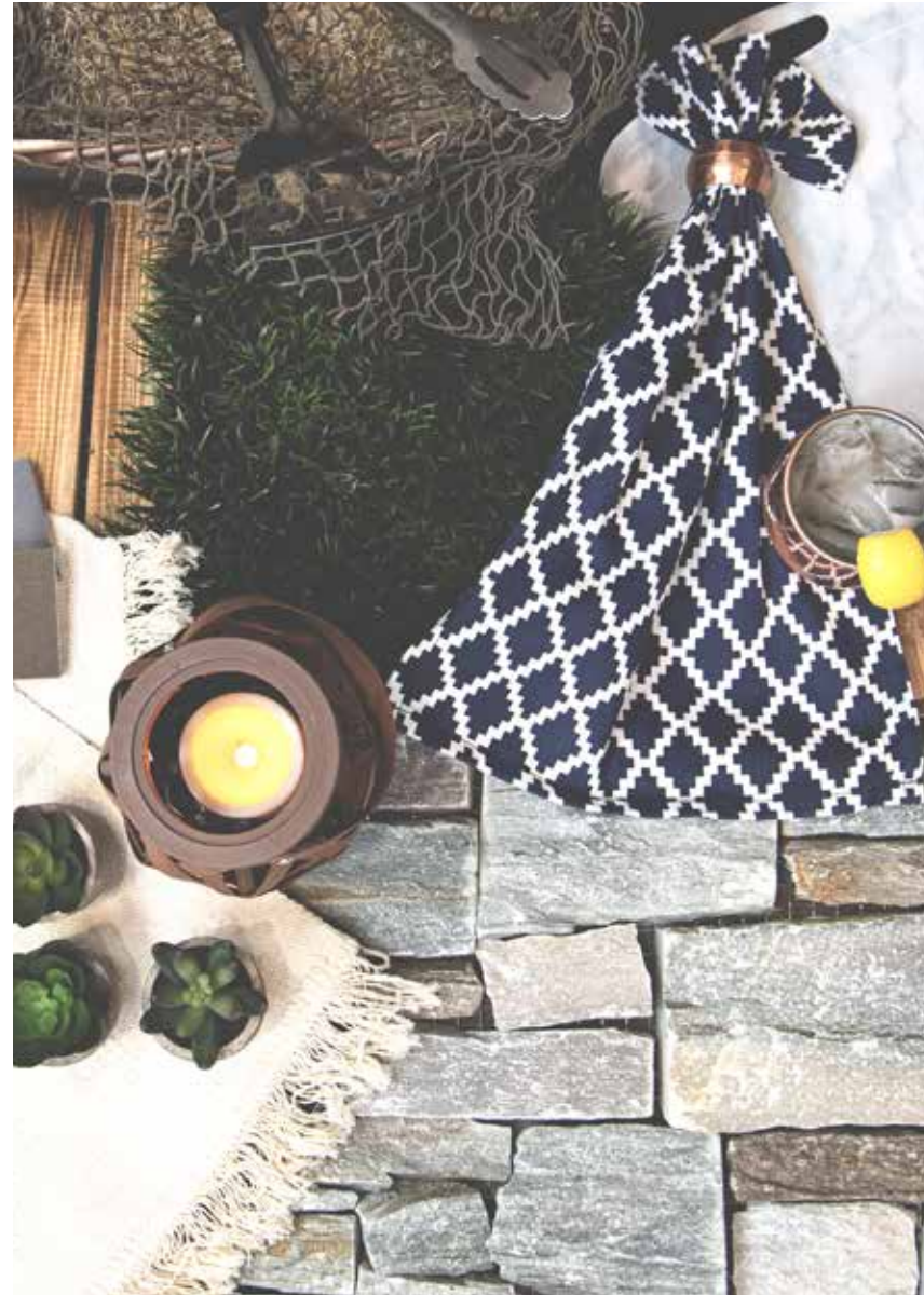
Featured Product - Nordic, TRADITIONAL

TIER® Traditional is a classic stone panel that offers a rugged yet tailored look. Flat panels have a unique bow-tie shape versus a rectangular shape. Comprised of three panel components: Flats, Corners and Starter Strips, these modular shapes fit seamlessly together, eliminating the need for specialized labor. Traditional from TIER® is an ideal option for residential and commercial exteriors, outdoor living applications, fireplaces, feature walls, and more.