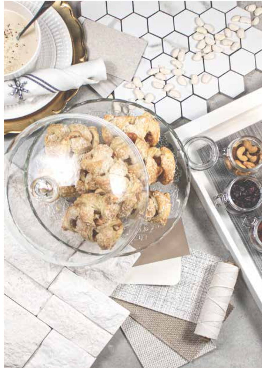
Featured Product - Myra Limestone, CRAFTED

TIER® Crafted is a rugged yet modern panelized stone veneer. Each panel is composed of several individual stones that have been dressed by hand, exemplifying a truly hand-crafted panelized stone veneer. Crafted from TIER® Natural Stone is perfectly suited for exterior façades in creating curb appeal, as well as interior applications like feature walls, backsplashes, fireplace surround and more.