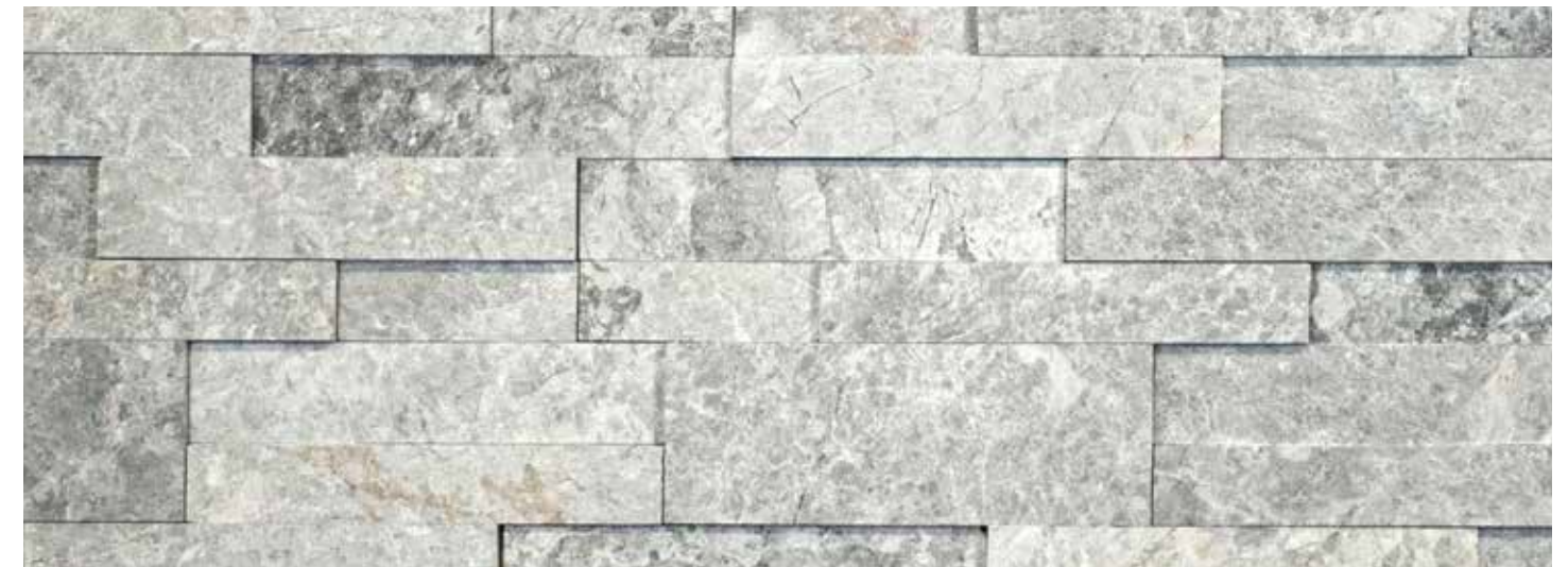
TUNDRA GREY Marble