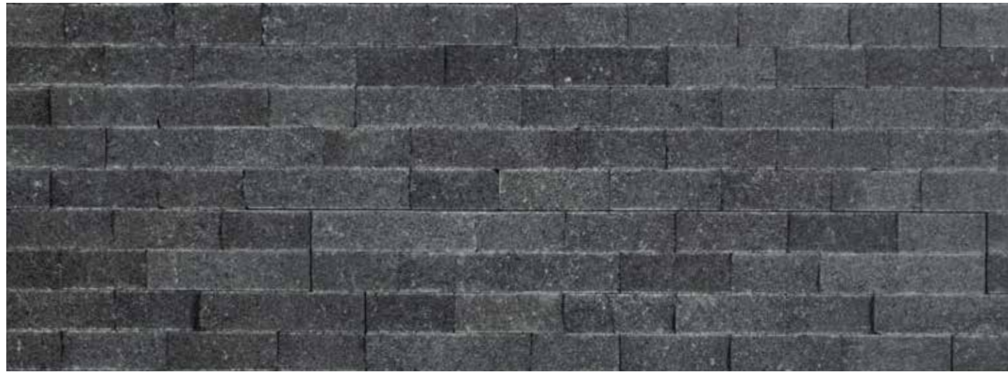
GREY BASALT Basalt