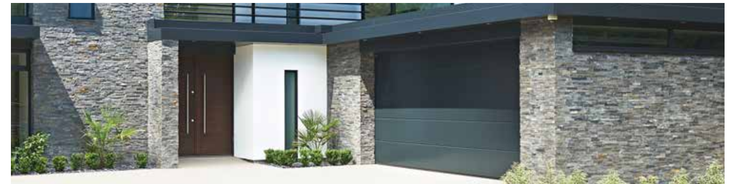
Featured Product - Charcoal, CONTEMPORARY

The simple yet clever panel designs of our TIER® Panel System allows each section to interlock seamlessly together, producing all the charm and elegance of a natural stone surface.