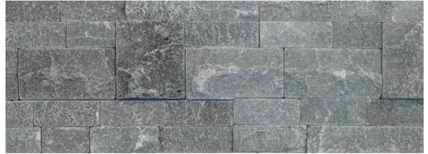
GREY BASALT Basalt