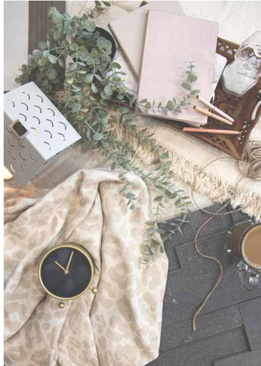
Featured Product - Grey Basalt, 3D

TIER® 3D is an ultra-modern panel that captures shadow and depth from its unique varied stone sizes. Comprised of precision-cut natural stone, these interlocking contemporary panels are hand-assembled with absolute precision. 3D from TIER® is perfect for commercial and residential facades, fireplaces, outdoor kitchens and many other interior or exterior applications.