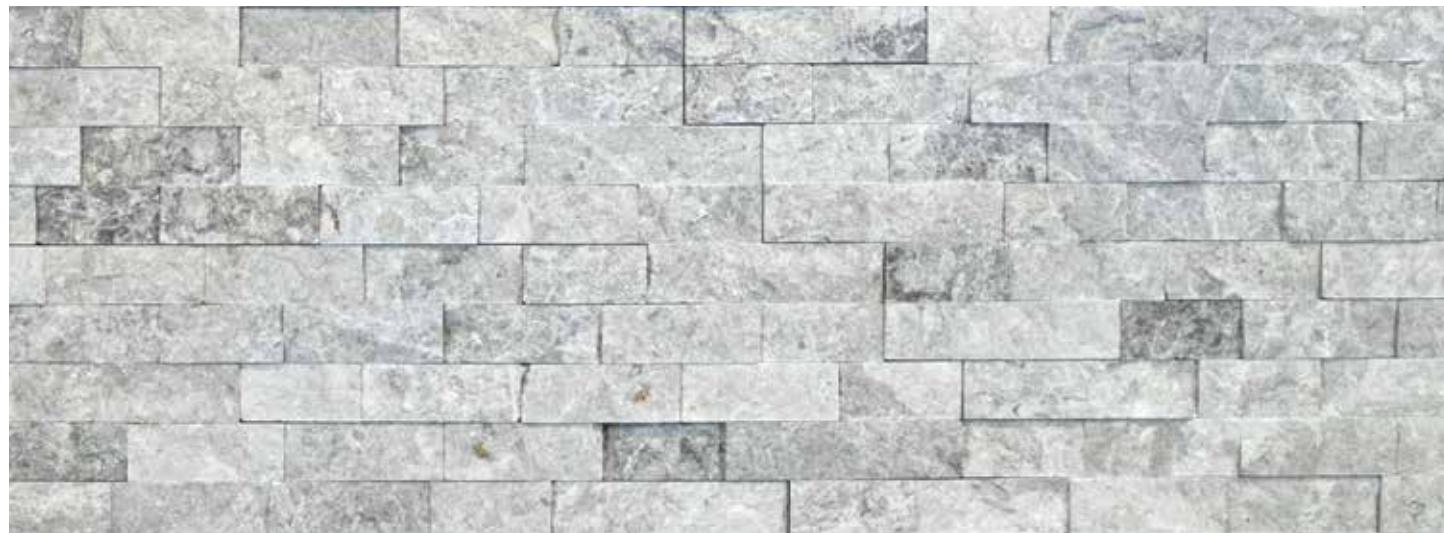
TUNDRA GREY Marble