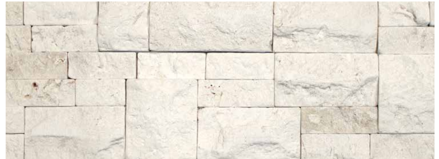
MYRA LIMESTONE Limestone