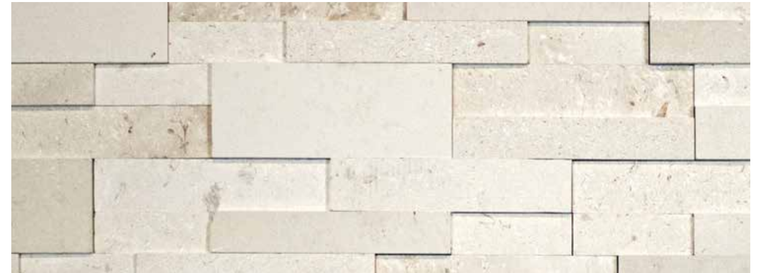
MYRA LIMESTONE Limestone