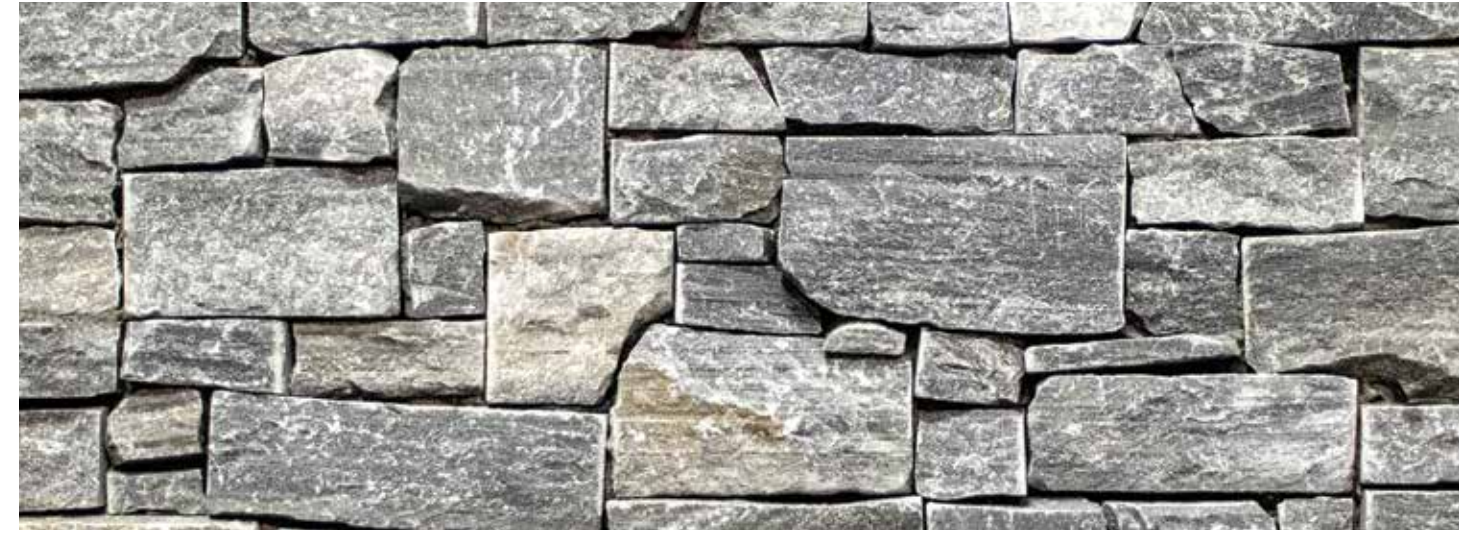
GREY SLATE Slate

*See page 15 for Corner & Starter Strip specifications.