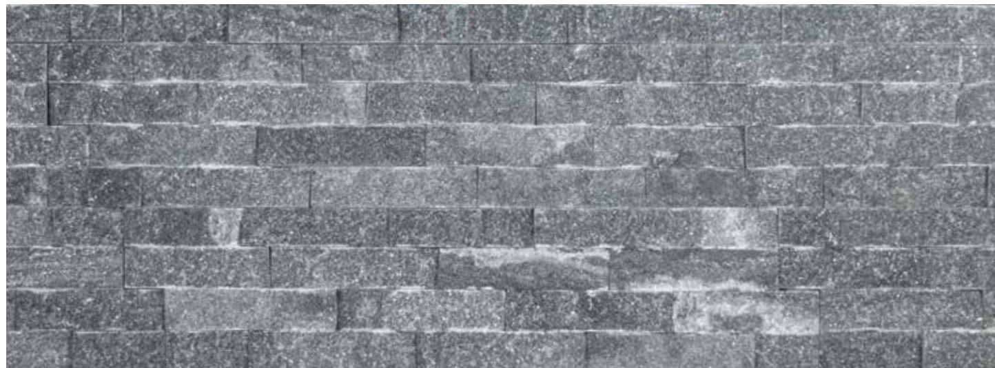
SILVER BLACK Quartz