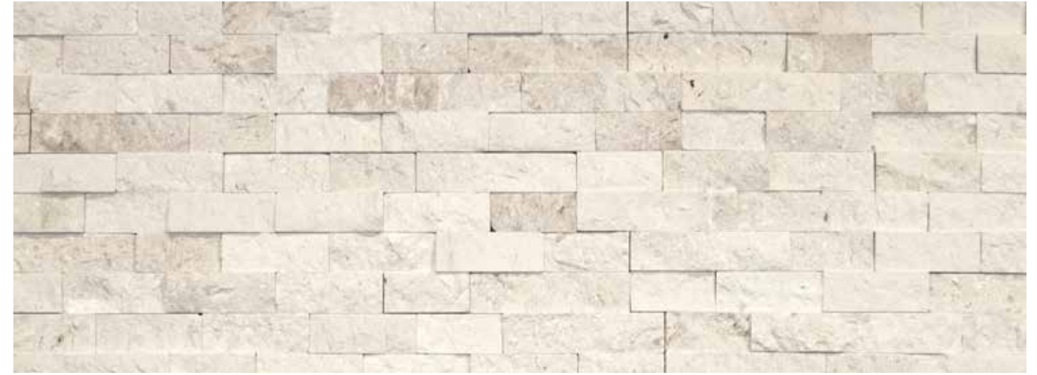
MYRA LIMESTONE Limestone