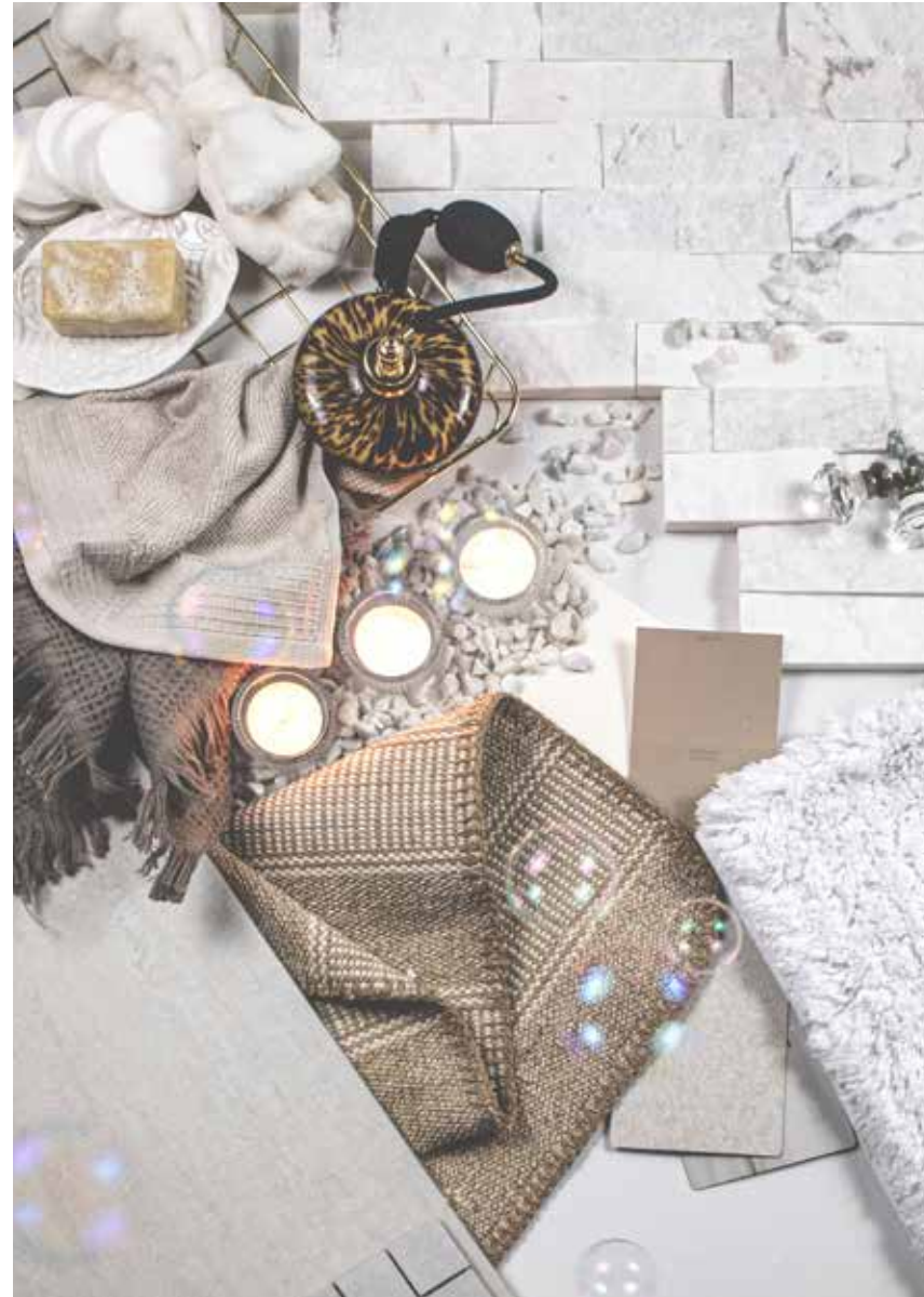
Featured Product - Milky White, CONTEMPORARY

TIER® Contemporary is a thin panelized stone veneer made from split face stone. Its various depths and textures showcase the stones natural beauty. Contemporary from TIER® Natural Stone is ideal for exterior feature walls, courtyards and entertainment areas. Equally well suited for interior use, these stone panels are also perfect for use on fireplaces and feature walls.