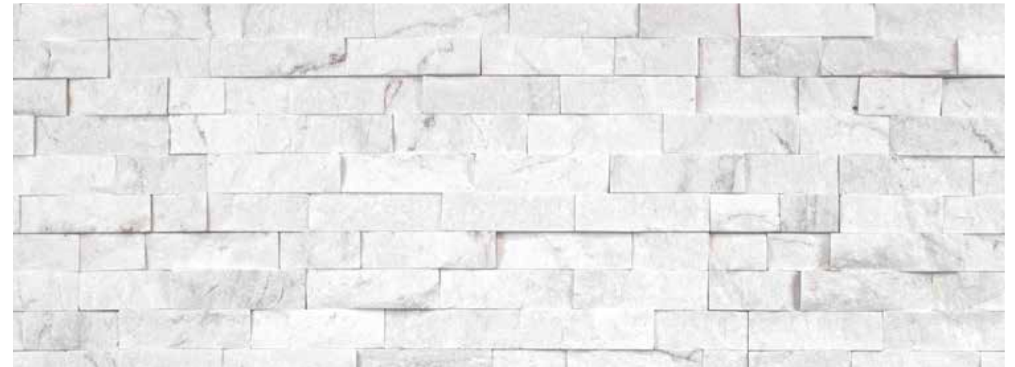
MILKY WHITE Marble