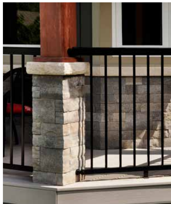
The low profile finish characteristic of Dry-Stack presents a beautiful balance between contemporary appeal and traditional integrity.